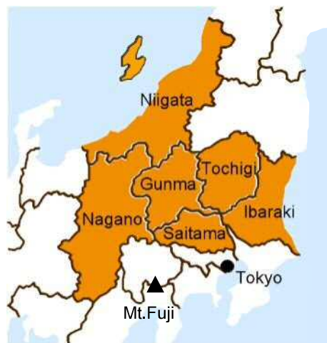
Six prefectures in the Kanto-Shinetsu region of Japan

Kanto-Shinetsu Sake Awards are the traditional sake awards held by the Kanto-Shinetsu Regional Taxation Bureau of the National Tax Agency of Japan, which has jurisdiction for the Kanto-Shinetsu region's six prefectures (Ibaraki, Tochigi, Gunma, Saitama, Niigata and Nagano). The awards were first held in 1965 and the most recent awards held in 2022 marked the 93th.