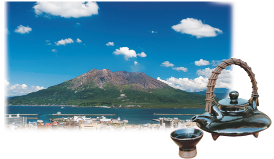
Sakurajima (Kagoshima City) and Drinking vessel of Kagoshima (Kurojoka)

The single distilled shochu, “Satsuma”, is made from high-quality fresh sweet potatoes which can be obtained easily because Kagoshima Prefecture is also good sweet potato production area. “Satsuma” has a sweet flavor harmonized with its rich floral aroma, and has smooth mouthfeel even just after distilled.