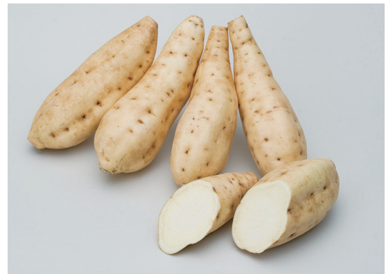
Kogane Sengan (sweet potato)