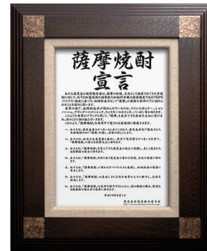
Satsuma shochu declaration