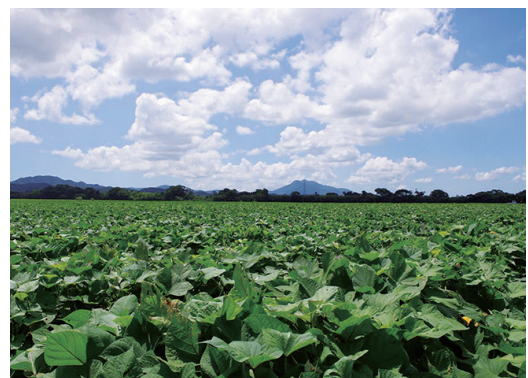
Sweet potato field

There are many regions with good drainage and those at low groundwater levels in Kagoshima Prefecture. Kagoshima Prefecture has been a well-suited place to grow sweet potatoes and has become the largest production area in Japan since mid-Edo period (1603-1868). That is why Kagoshima Prefecture maintaining supply of sweet potato is an ideal area for producing sweet potato shochu.