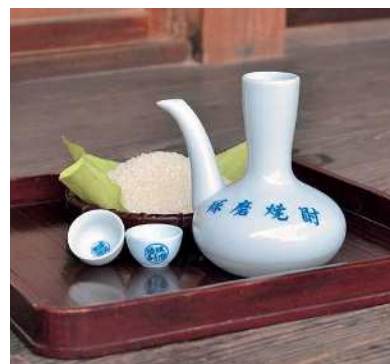
Kuma Shochu drinking set (Gara and Choku)

Note: Moromi fermented by rice koji and water must be made by adding rice koji and water to its first moromi and then further fermented