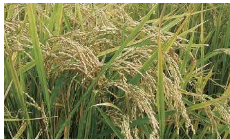
Rice made in Japan